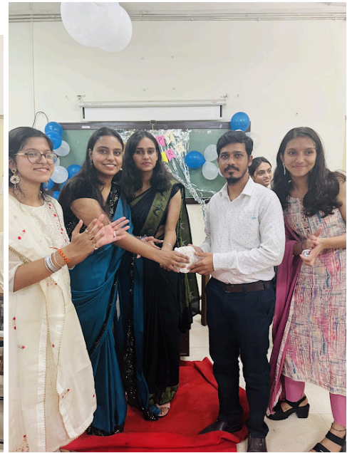
Presenting faculties with gifts and letters

To add an element of fun and engagement, several activities were organized. A lively game of dumb charades had everyone laughing and participating enthusiastically. The highlight of the celebration was the DJ session that followed, where both teachers and students danced together, breaking all formal barriers and celebrating the joyous occasion.