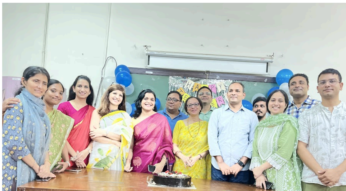
Cake cutting ceremony