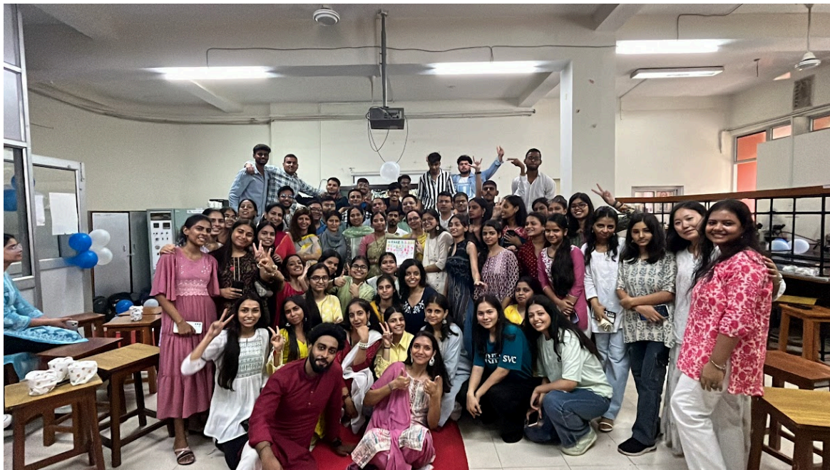
Group Photo Session

The program concluded with refreshments served to all 67 attendees, ensuring everyone left with a happy heart and cherished memories and a group photograph. The collaborative efforts of the Botany Department students were evident in the seamless organization and the warm atmosphere they created. It was a perfect reflection of respect, love, and admiration, making it a day to remember for everyone involved.